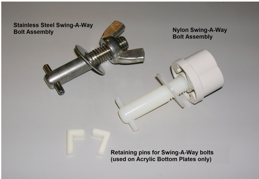
Figure 1-3: Example of the two kinds of Swing-A-Way Bolt Assemblies.

The following page contains part numbers for Geotech's In-Line Filter Holders.