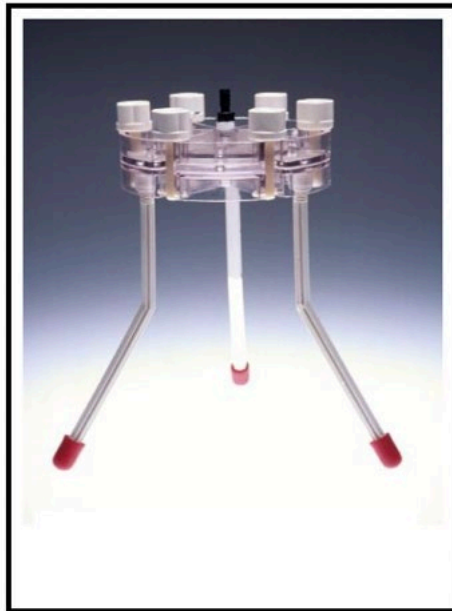
Polycarbonate In-Line Filter Holder