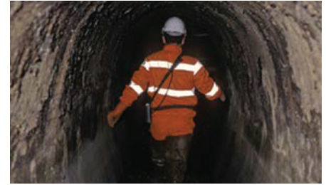
Confined Space Entry