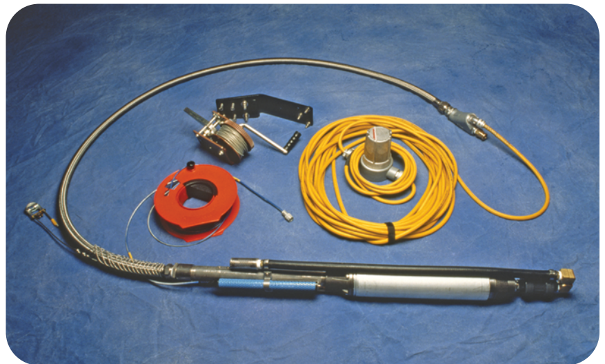
Geotech High Volume Probe Scavenger System with Optional Lifting Winch