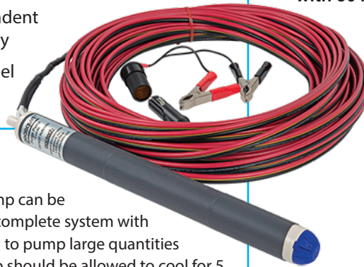
Triple Stage geosquirt with 90 ft. (27 m) Motor Lead