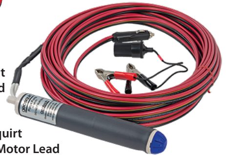
Double Stage geosquirt with 60 ft. (18 m) Motor Lead