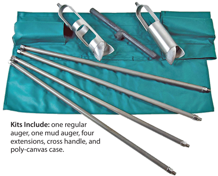
Kits Include: one regular auger, one mud auger, four extensions, cross handle, and poly-canvas case.