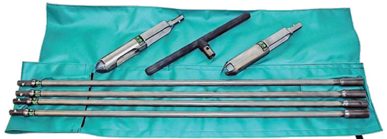
Kits Include: one regular auger, one mud auger, four extensions, cross handle, and poly-canvas case.