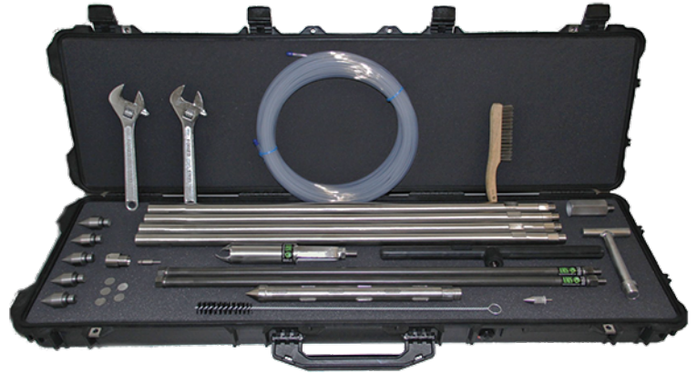
Case with Piezometer Parts & Extensions