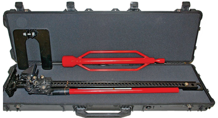
Case with Removal Jack & Hammer