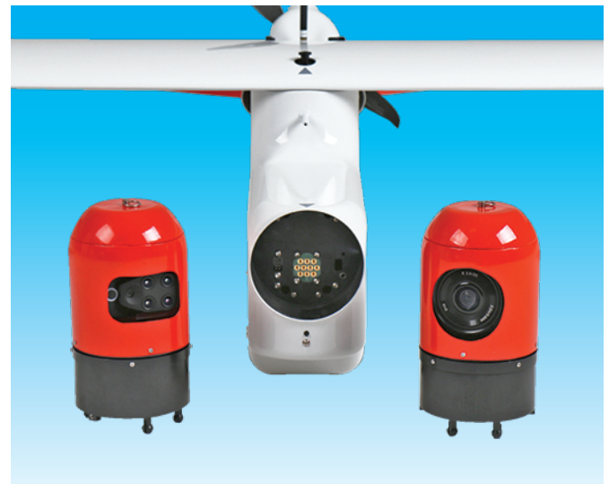
Quick interchangeable sensor payloads