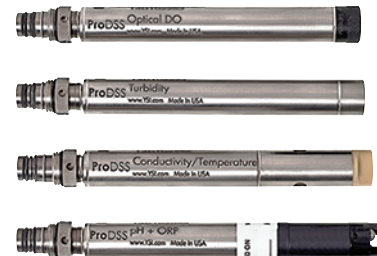
Titanium smart sensors can easily be replaced in the field