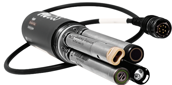
4-Port Bulkhead with four user replaceable sensors

*Included with all ProDSS 4 port cables that are 10 meters and longer