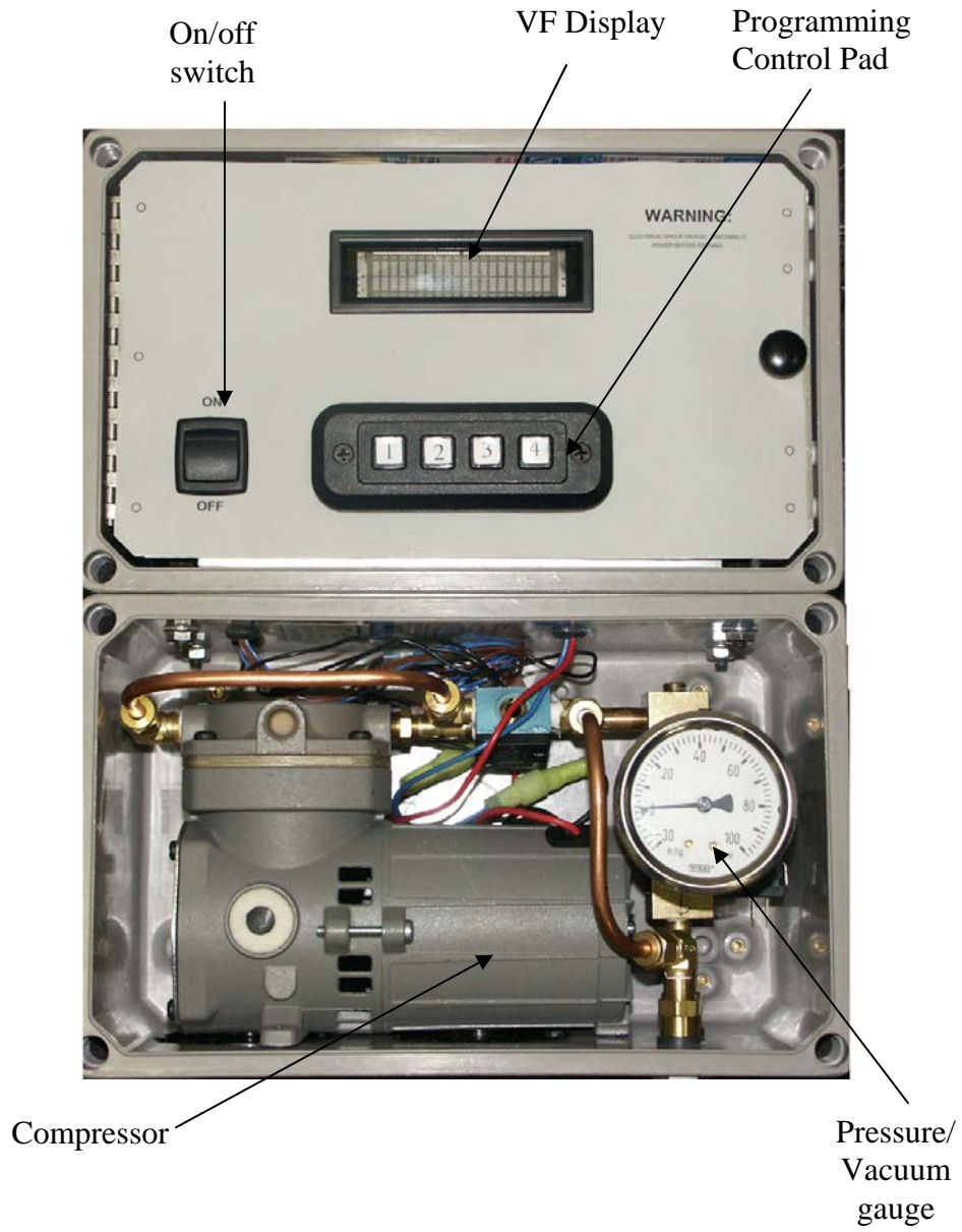
Figure 2 – Installation Diagram