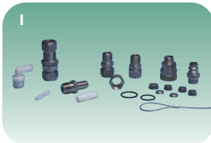
Compression Fittings and Hose Barbs