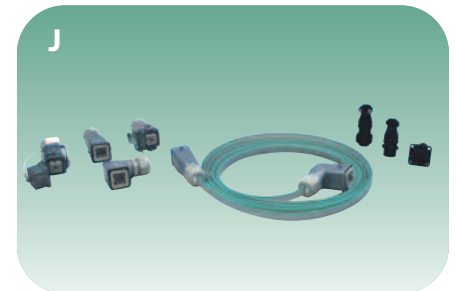
Electrical Connectors and Extension Cords