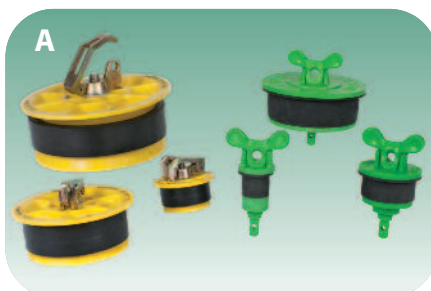
Expandable Locking Well Caps