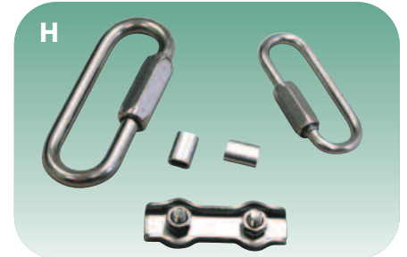
Quick Links, Crimps and Cable Clamps