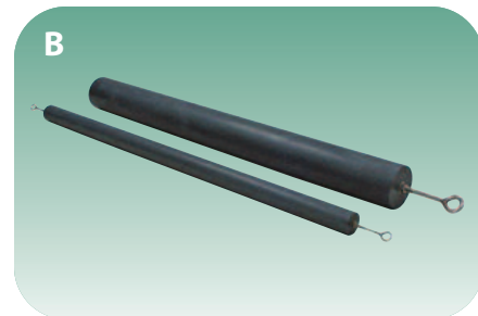
1½" and 3" Well Slugs