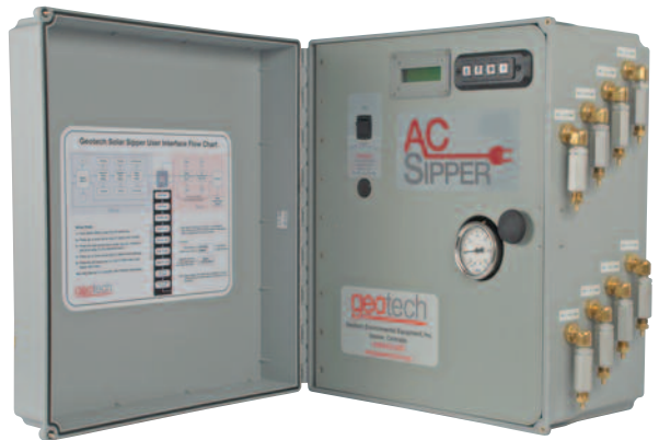
Control Panel and Pressure/Vacuum Pump (eight-well controller shown)

The Geotech AC Sipper is also available for recovery of sinking product (DNAPL) from wells when using a fixed intake.