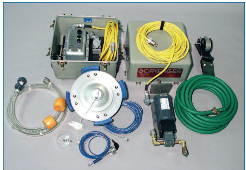
Large Diameter Dangle Scavenger system with optional case

When approximately one liter of hydrocarbons collects in the buoy base, a float switch is activated, turning the pump on. Thus, water-free product is automatically pumped into a recovery tank. A water sensing switch is also located within the buoy. Should water enter the buoy, a density switch is activated, shutting off the pump and activating an alarm light. This automatic feature prevents recovered hydrocarbons from being contaminated by water.