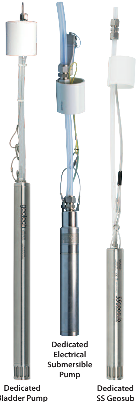
Dedicated Bladder Pump