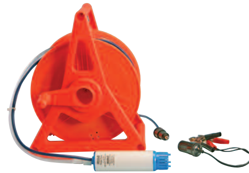
Single Stage GeoSub system with portable reel and tubing

The GeoSub centrifugal pump can be purchased alone or as a complete system with reel and tubing. It is used to pump groundwater from shallow wells. Pump should be allowed to cool for 5 minutes for every 15 minutes of operation. It can operate in water temperatures as high as 140° Fahrenheit, but must be submerged at all times.