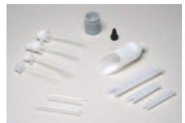
Disposable Bailer Accessories

*Does not contain additive to speed biodegradation.