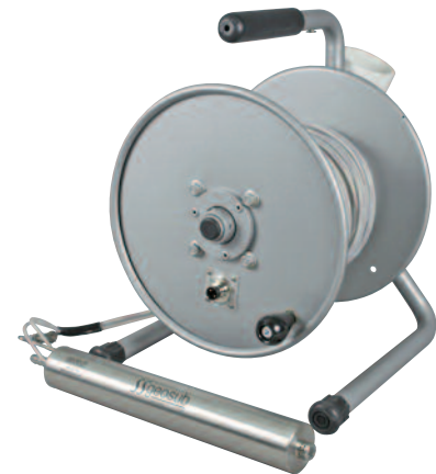
SS Geosub with Geo Reel