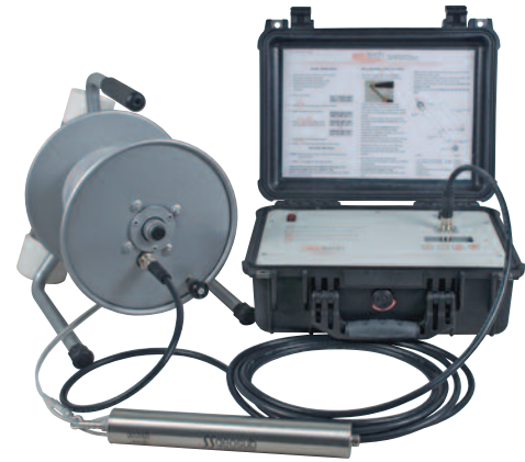
SS Geosub with Geotech AC Controller