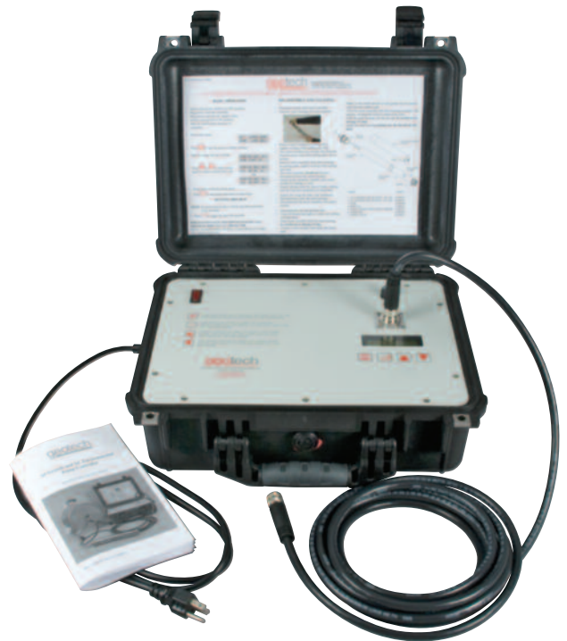
Geotech AC Controller