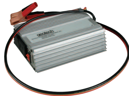
Optional DC to AC Inverter