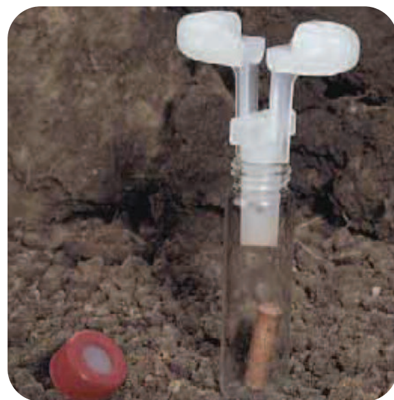
Transferring soil sample from Terra Core Sampler® into a 40ml VOA vial.