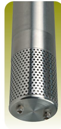
Bottom Fill with 2" (5cm) Screen