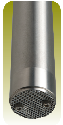
Bottom Fill with Flat Screen