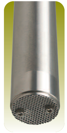
Bottom Fill with Flat Screen