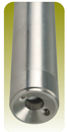
Bottom Fill with No Screen