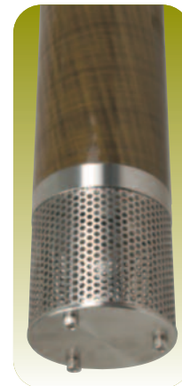
Bottom Fill with 3" (7.6cm) Screen