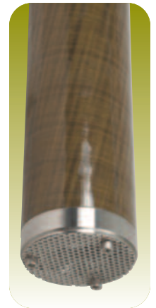
Bottom Fill with Flat Screen