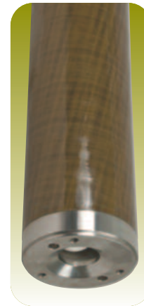
Bottom Fill with No Screen