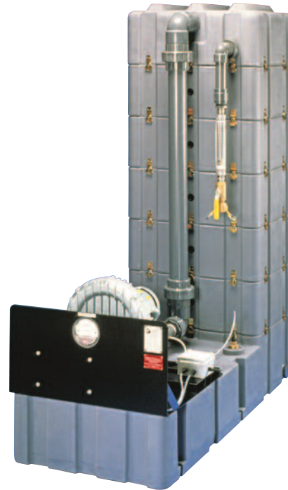
Geotech LO-PRO™ Model II

Contaminated water enters the Geotech LO-PRO™ at the top of the unit and cascades onto the first of a series of stainless steel bubble plates. A baffle in the center of each plate redirects the water 180° in each stage as it flows downward, alternating between clockwise and counter-clockwise directions. This action optimizes the residence time of the water in the Geotech LO-PRO™, allowing for efficient contaminant removal.