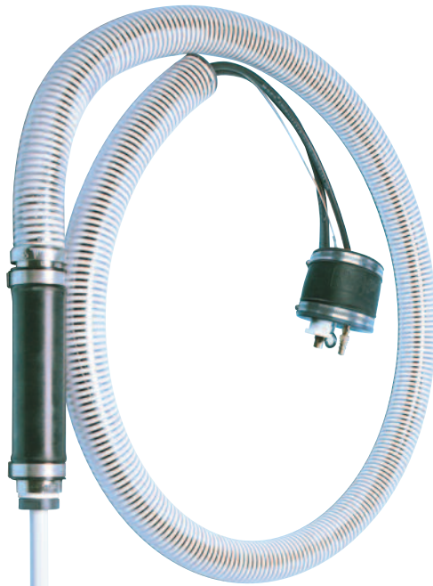
4" (10 cm) Geotech Plume Eater®