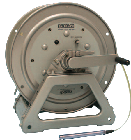
1500' (450m) Water Level Meter (manual rewind)