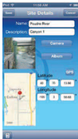
Recognize sites with photo and GPS tags.