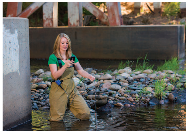
Get accurate results and long-lasting calibrations.