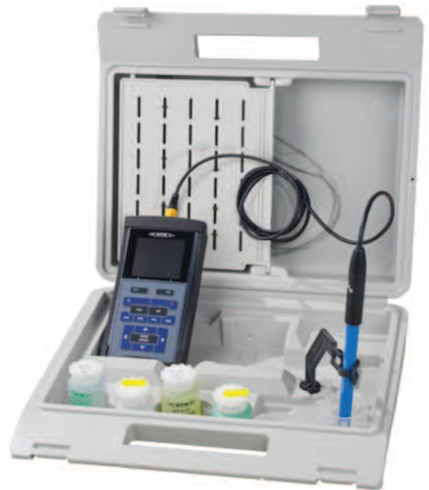
Set Carry Case