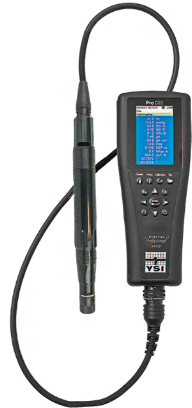
ProDSS with ODO/CT probe and cable assembly