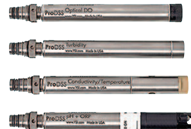
Titanium smart sensors can easily be replaced in the field