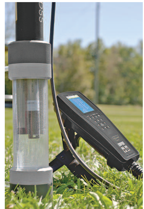
ProDSS attached to Tripod and Flow Cell for groundwater applications