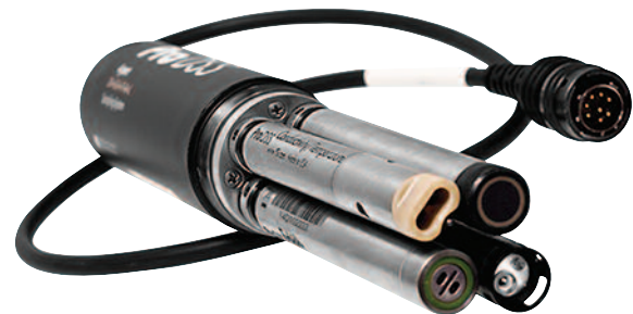
4-Port Bulkhead with four user replaceable sensors

*Included with all ProDSS 4 port cables that are 10 meters and longer