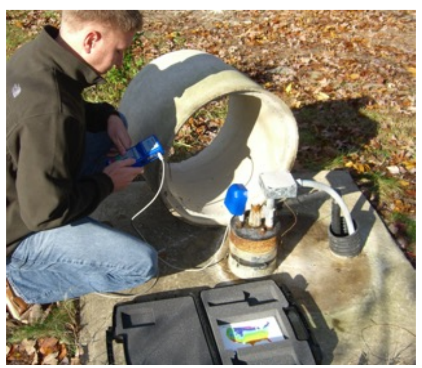
BACKGROUND - HOW IT WORKS

The Well Sounder works by pushing an air pressure wave or low frequency sound wave into the well. For this reason, it is important that the probe be connected to a closed end of the pipe to prevent the air pressure from just escaping the open end. After the Well Sounder sends its sound pulse, it listens for the pulse to return. And since sound travels at a predictable rate, it can tell where in the well the pulse was reflected by timing the returning pulse.