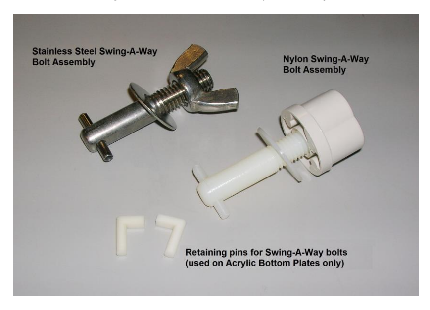
Figure 1-3: Example of the two kinds of Swing-A-Way Bolt Assemblies.

The following page contains part numbers for Geotech's In-Line Filter Holders.