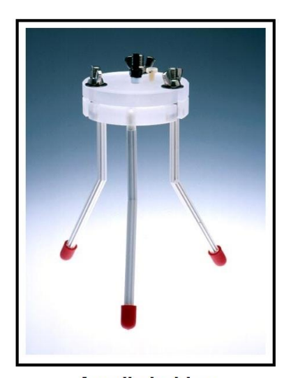
Acrylic In-Line Filter Holder