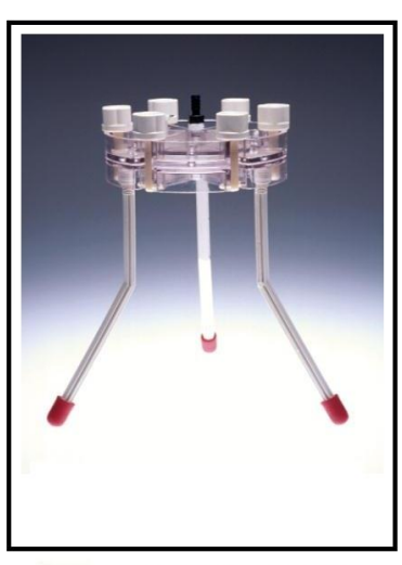
Polycarbonate In-Line Filter Holder