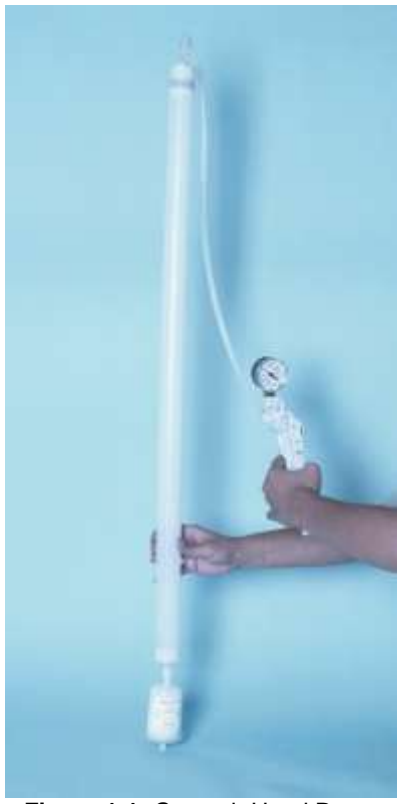
Figure 1-1: Geotech Hand Pump

The Geotech Hand Pump is simple, accurate, easy-to-use, and has many applications. It consists of a pump body, movable handle, vacuum/pressure gauge, and a dual converter. The pump is easily held in your hand as shown in figure 1-1.