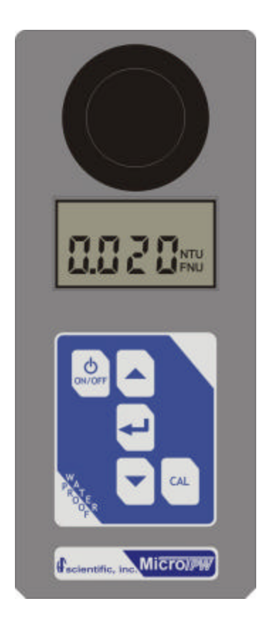
Figure 1: Top view of the instrument (MicroTPW shown).

Figure 1 is a depiction of the top of the instrument. The three main components of the instrument are the sample well, the display, and the touch pad. The following sections will describe the functionality of the display and the touch pad. The proper use of the instrument and the sample well will be discussed in later sections.