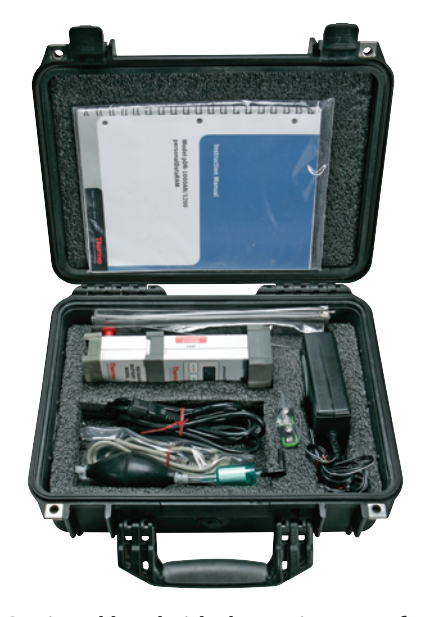
Optional hard-sided carrying case for your personal DataRAM