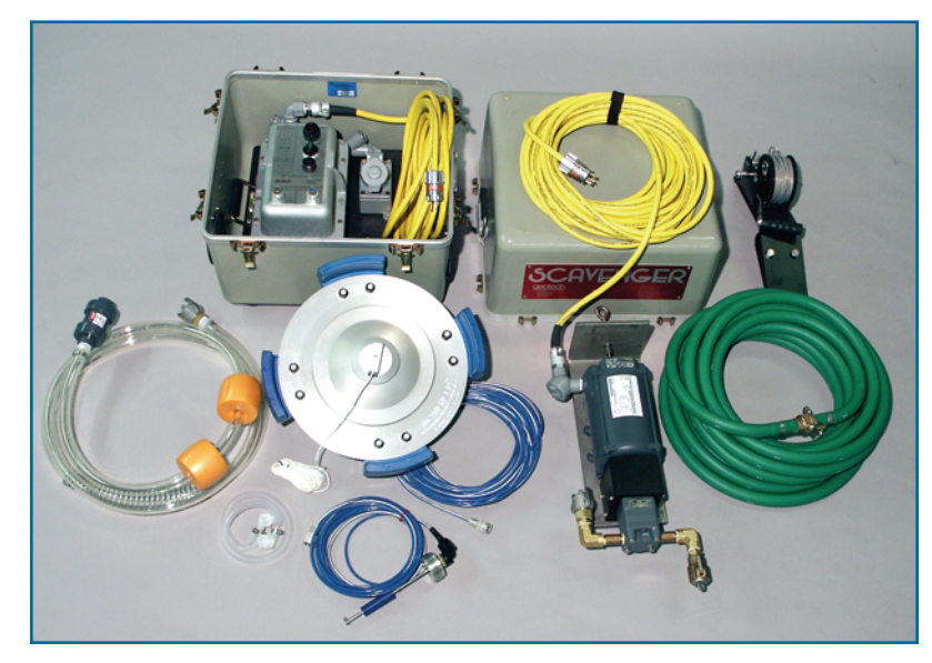
Large Diameter Dangle Scavenger system with optional case

When approximately one liter of hydrocarbons collects in the buoy base, a float switch is activated, turning the pump on. Thus, water-free product is automatically pumped into a recovery tank. A water sensing switch is also located within the buoy. Should water enter the buoy, a density switch is activated, shutting off the pump and activating an alarm light. This automatic feature prevents recovered hydrocarbons from being contaminated by water.