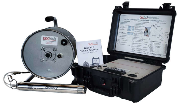
Geotech Geosub 2 & Controller

Enjoy complete control and convenience with our user friendly interface that features a vibrant display – perfect for precision groundwater sampling. Robust construction plus simple set up through easy connection cables make it an ideal solution that you can take anywhere!