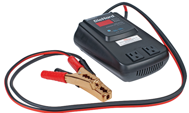
Optional DC to AC Inverter