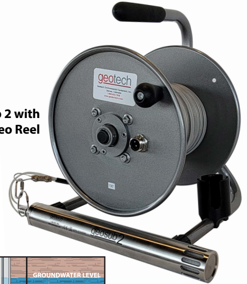
Geosub 2 with Optional Geo Reel