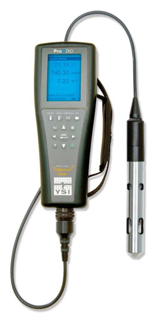
The ProODO is a digital signal instrument. Any ProODO cable can be connected and used on any ProODO instrument. The luminescent optical probes hold the calibration information internally.