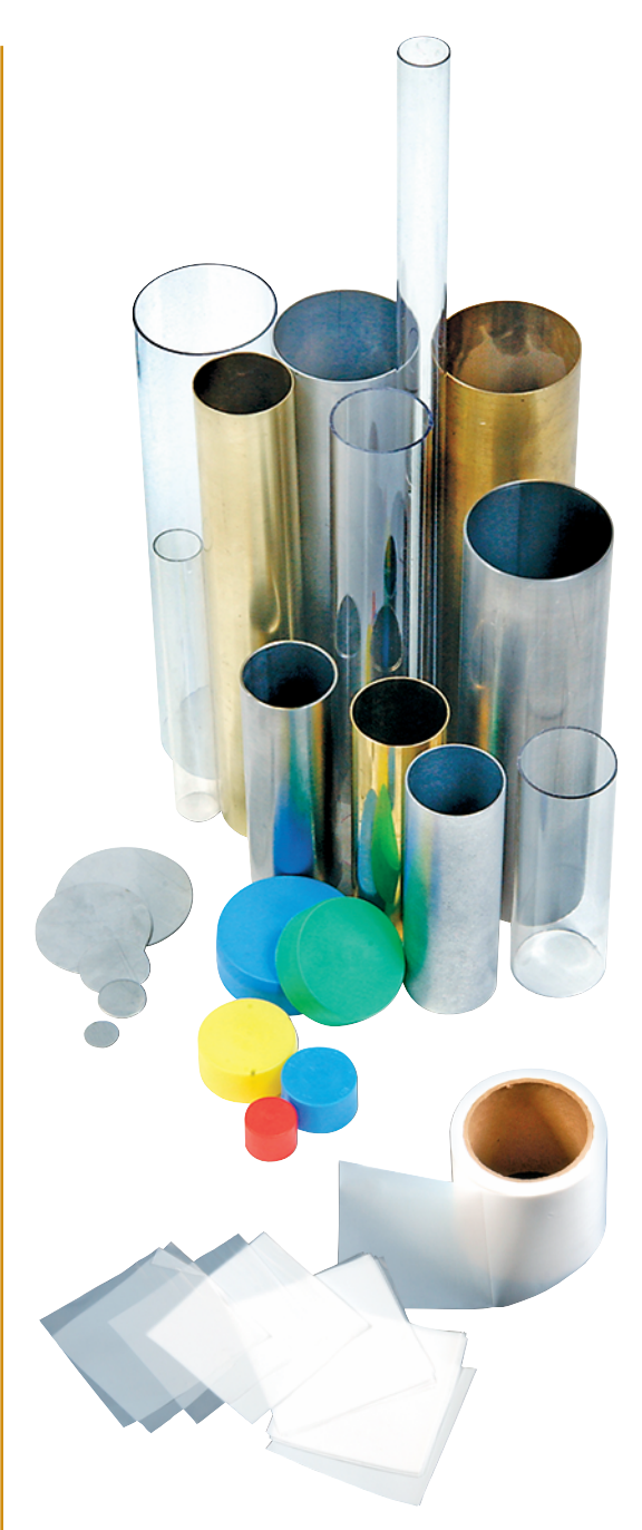
Cylinders, Caps and Sample Supplies