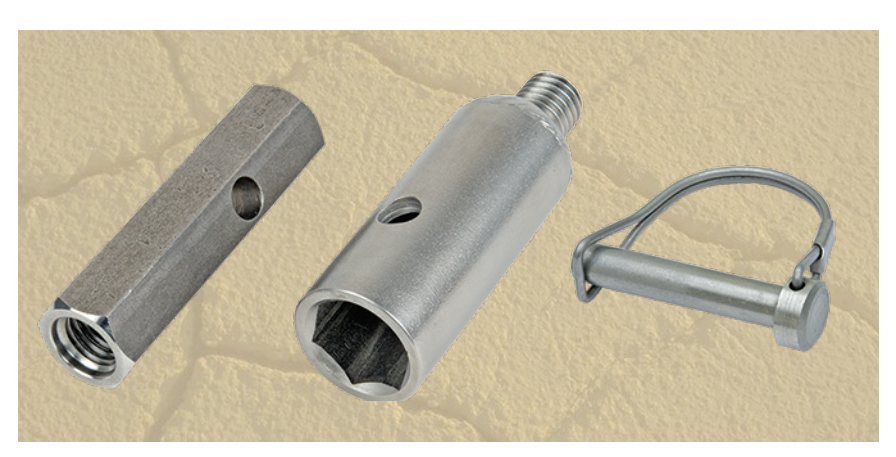
Convert 5/8" threaded samplers to Geotech Quick-Connect System