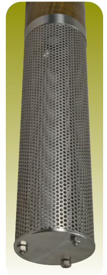
Bottom Fill with 12" (30.5cm) Screen