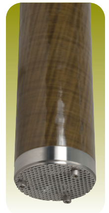
Bottom Fill with Flat Screen