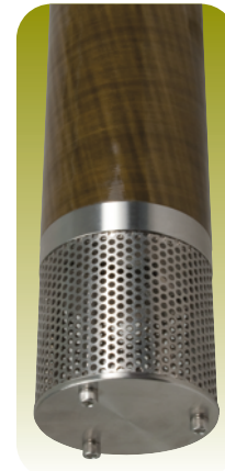
Bottom Fill with 3" (7.6cm) Screen