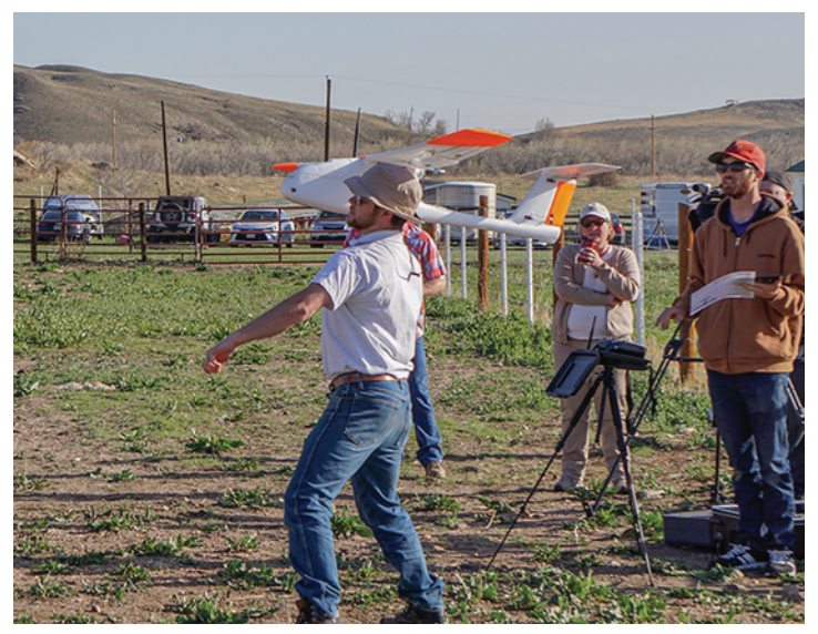
Available Flight Training