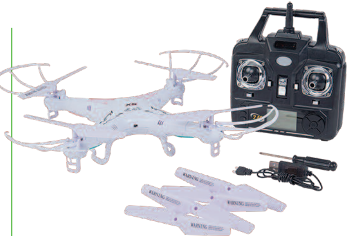
Every student gets to keep an indoor UAS trainer

Whether students are pursuing careers in UAS inspection, surveying, photogrammetry, geospatial, and/or search and rescue, excellent mission planning and execution is critical to a successful outcome. Instructors will present real-world mission scenarios where students and instructors work together to plan and execute the mission.