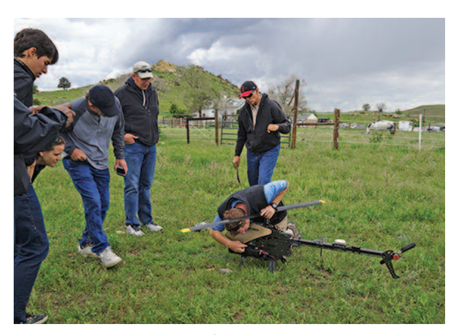
Outdoor flight training