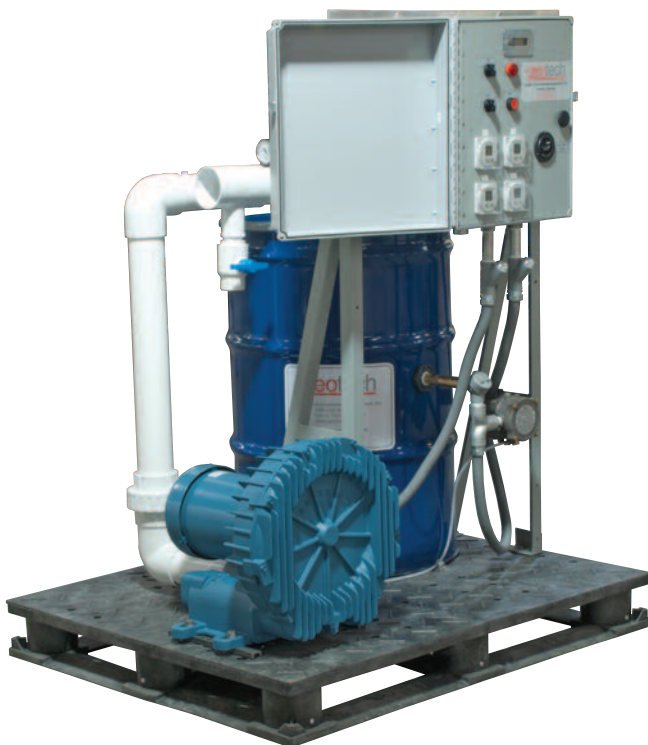
Regenerative Blower SVE with optional Geotech Environmental Control Module

Note: Higher flow and vacuum versions are available.