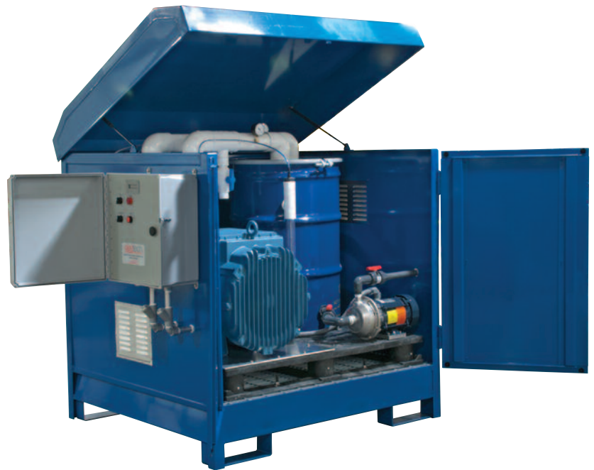
Regenerative Blower SVE inside optional hazmat enclosure

Every Geotech SVE system is factory assembled and fully tested for function, performance, and safety to meet the design conditions of each site application.