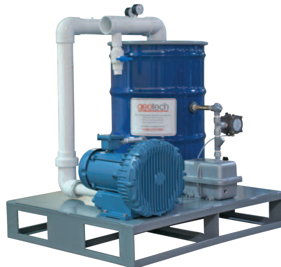
Regenerative Blower SVE