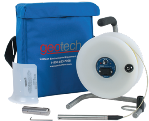
Geotech ET with optional bag and tape weight