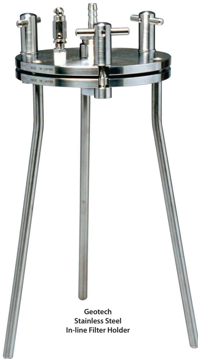
Geotech Stainless Steel In-line Filter Holder